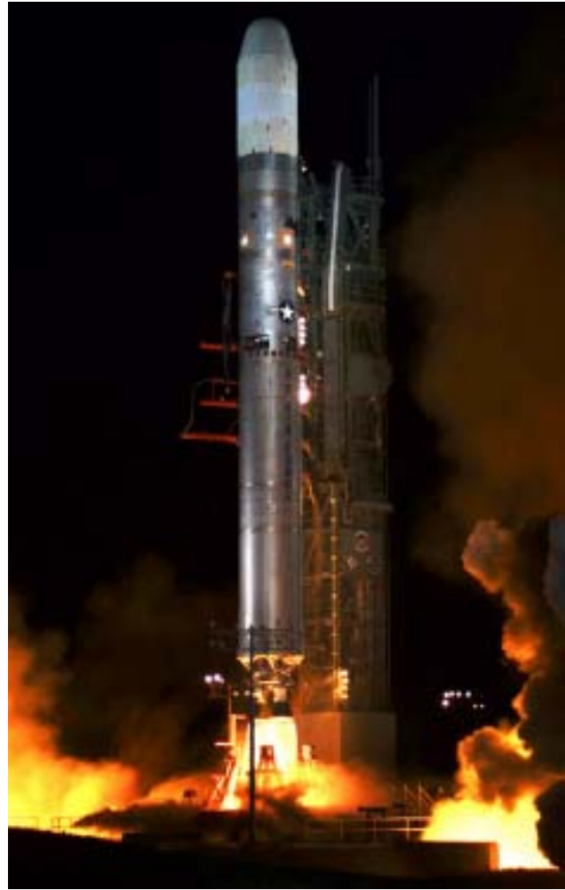
Figure 1 (a) Coriolis spacecraft with the Solar Mass Ejection Imager (SMEI) instrument on board prior to launch. The three instrument camera baffles (circled). (b) Titan II launch of the Coriolis spacecraft on 6 January 2003 with on board SMEI and WindSat.

Of most interest to the Air Force and other forecast facilities such as NOAA is the ability to view and forecast the arrival of heliospheric structures at Earth. This potential aspect of the SMEI data has provided the impetus for the 3D reconstruction of the heliosphere in real time. There have been numerous attempts to reconstruct coronal structures in the corona and heliosphere in three dimensions. These techniques, reviewed elsewhere 14,15 , have been motivated by attempts to determine heliospheric structure morphology in order to determine their physics, their dynamics and most recently to forecast their arrival at Earth using remote sensing techniques.